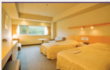
Grand Main Building