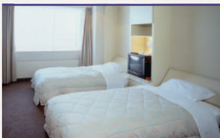
Grand Villa 3

Please contact us for the prices between 30Dec - 1Jan. Deductions for children and seniors: 13-18 years $77, 60+years $39